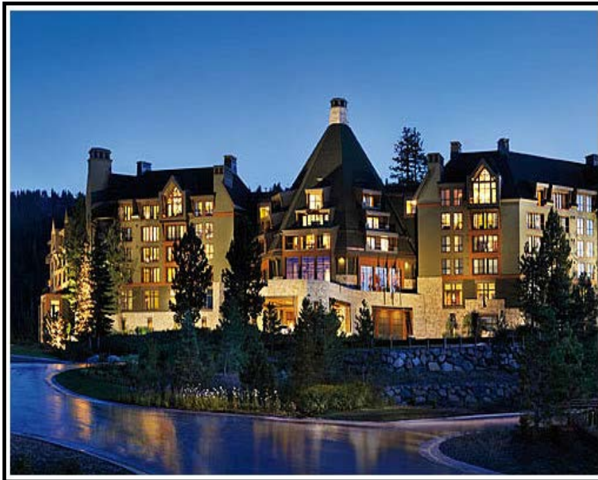
The Aston Lake Land Village, Mid July 2013

Our all-season retreat features a private sandy beach with a pier and boat moorings, outdoor heated pools, a kid's wading pool, two hot tubs, a sauna, a fitness facility, tennis courts, and a beachside bistro.