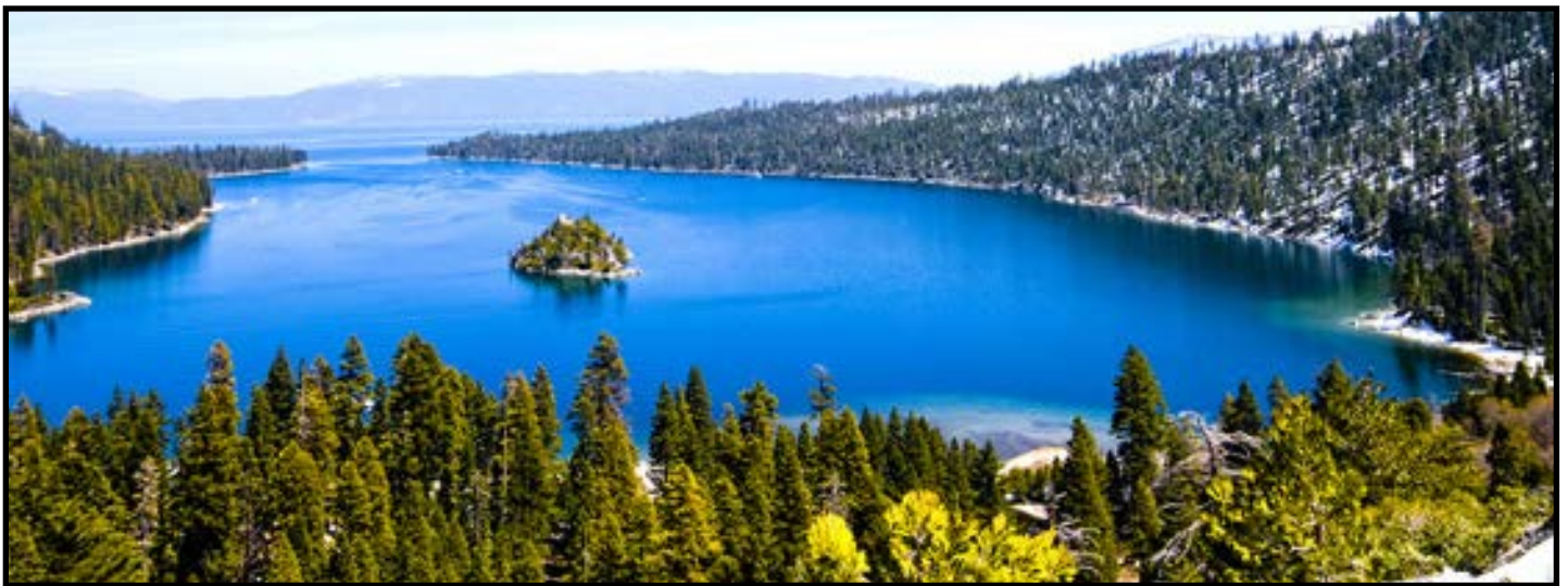
South Lake Tahoe, February 2013

Lake Tahoe, located at 6,200 feet elevation, is in the heart of the Sierra Nevada Mountains. The California and Nevada state border runs down the middle of Lake Tahoe. Lakeland Village is located on the beach at South Lake Tahoe off U.S. Highway 50 near the base of Ski Run Blvd., one mile west of the State-line casinos.